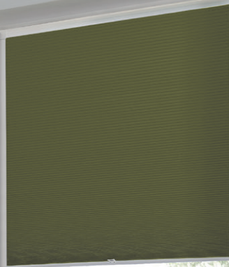
Fabric, Palermo Graphite