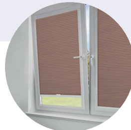
TILT & TURN WINDOWS